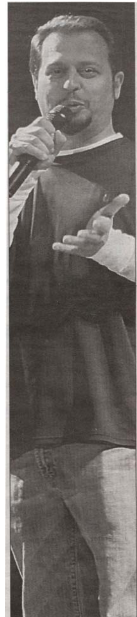
Sal the Stockbroker